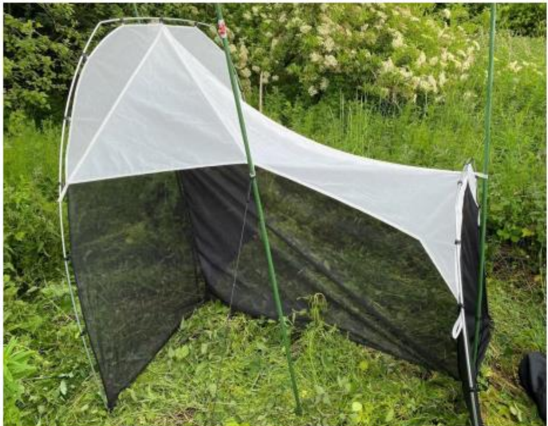
Figure 1 – Malaise trap set up along scrub edge on Bed No.3, Woolston Eyes SSSI

A Malaise trap (Fig.1) was set up on No.3 bed (Fig. 2) and left over the following time periods – 06/06/22 to 15/06/22 and 04/07/22 to 18/07/22. It acts as an insect flight interception trap and collects and preserves the catch. Sweep netting was also undertaken on visits to set up and take down the trap, and casual records of easily identifiable species noted. The weather was a little mixed during the June survey, but hot during the July survey. Identification was carried out by the author, Nick Button, Krisz Fekete, Vicky Gilson, Keith Fowler, and Peter Chandler.