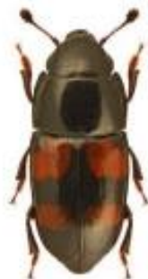
Fig. 3 – Glischrochilus sp. ( https://baza.biomap.pl/pl/db/ )

A total of 195 species were identified, including one species noted as new to Great Britain. This was a species of Glischrochilus beetle (Fig. 3), which belongs to the Nitidulidae or sap beetles, and was only known previously from Eastern Europe. The species specifically isn't mentioned here, as an article is being prepared for publication in The Coleopterist and should not be prejudiced until formally published. The largest group identified were flies (76), followed by beetles (36), true bugs (36), butterflies and moths (14), bees, wasps, sawflies, and parasitic wasps (12), spiders and harvestman, (12), damselflies and dragonflies (3), springtails (2), and singletons of earwing species, barkflies, molluscs, and caddisflies. A full list of species encountered are listed in the Appendix of this report